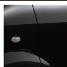
Prime Cool Black (ZBD)