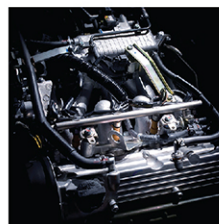
1.6 Liter, 4 Cylinder SOHC 16V Engine

APV is also best for business looking for a reliable and cost-effective vehicle that you can always depend on. So whether it's for business or pleasure, you know you can live life to the fullest and enjoy more ..... the APV way.