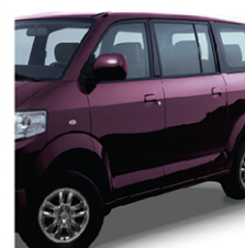
High Ground Clearance