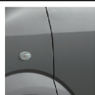
Graphite Gray Pearl Metallic (ZDL)