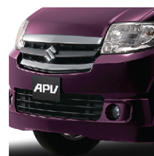
Front Fog Lamps