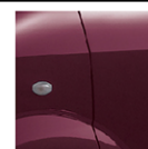
Pearl Burgundy Red (GLX) (ZLL)