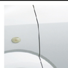
Superior White (GA) (26U)