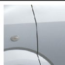
Silky Silver Metallic (Z2S)