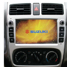
8-inch Infotainment System